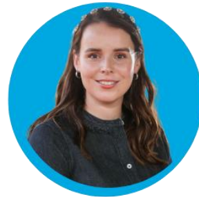
LAOISEACH SCULLION Policy Analyst (Markets and Grid)